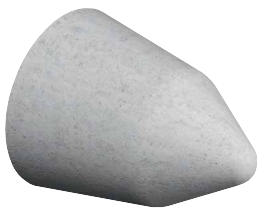
poured concrete foot VB with BF: X = 8 with crossbar QT: X = 9