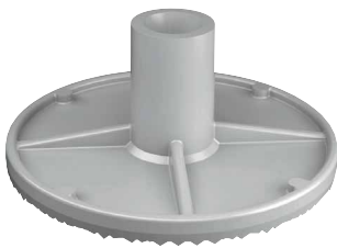
plastic foot GF 45 mm VB with GF: X = 6 with crossbar QT: X = 7